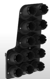
Die Storage Panel EVO